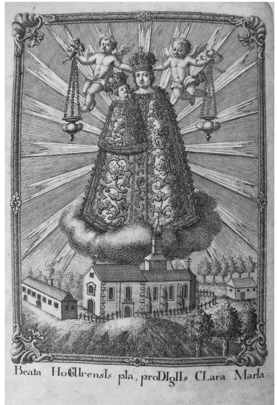
Ilustracija: Majka Božja Očurska, bakrorez u knjizi: Hilarion Gašparoti, Czvet szveteĥ , sv. IV., Beč, 1761.